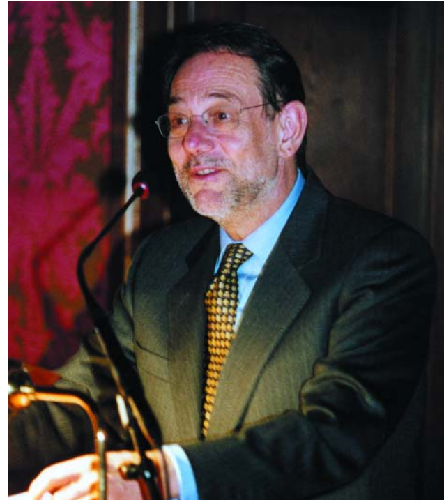
Javier Solana, the EU’s High Representative for the Common Foreign and Security Policy, at the Kronberg Talks on the Middle East, 2002.

The C·A·P uses this approach to advise political leaders on decisions about different issues. Simultaneously, it communicates the results of its work to the public and to a large number of opinion shapers via publications and the Internet.