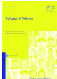
Susanne Ulrich: Achtung (+) Toleranz, Wege demokratischer Konfliktregelung. Praxishandbuch für die politische Bildung, Gütersloh 2005.