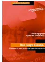
Forschungsgruppe Jugend und Europa (Ed.): Das junge Europa – Plädoyer für eine wirksame Jugendpartizipation, Bonn 2004.