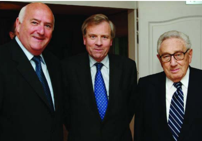
Prof. Dr. Werner Weidenfeld, NATO Secretary General Jaap de Hoop Scheffer, and Henry Kissinger at a meeting in Brussels, May 2005.

Whether they are dealing with the “war on terror”, globalization processes or EU’s neighbourhood issues, today’s decision-makers are confronted with multiple challenges that have a direct impact on citizens’ lives. Policymaking issues are increasingly complex, and social and political actors at both the domestic and international levels enjoy limited room for manoeuvre. Short terms of office often make it difficult for politicians to focus their sights on longer-term, broader developments. Economic actors are increasingly asked to take positions in political and ethical debates.