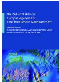
Die Zukunft sichern: Europas Agenda für eine friedlichere Nachbarschaft, Diskussionspapier XI. Kronberger Gespräche „Europa und der Nahe Osten“, Bertelsmann Stiftung, 30.10.2008/2008.