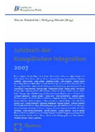
Werner Weidenfeld, Wolfgang Wessels (Eds.): Jahrbuch der Europäischen Integration 2007, Institut für Europäische Politik, Nomos Verlag, Baden-Baden 2007.