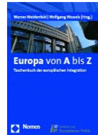
Werner Weidenfeld, Wolfgang Wessels (Eds.): Europa von A bis Z. Taschenbuch der europäischen Integration, Institut für Europäische Politik, Nomos Verlag, 2007.