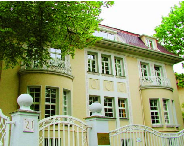
The C-A-P is located in the “Villa Faber” in Munich’s district Bogenhausen.

The C-A-P is divided into Research Groups that form the institution's working units. They produce analyses, position papers and workshops in their particular areas. At conferences, in publications and in the media, the Research Groups introduce strategies and policy options into the contemporary political discourse. Their activities also include the participation of an interdisciplinary network of national and international experts. Consulting services and lectures of the research fellows complement the academic work. The combination of topics, projects and resources in the Research Groups has built up a strong tradition – each department has a unique profile in applied research.