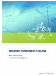
Bertelsmann Transformation Index 2008 – Politische Gestaltung im internationalen Vergleich, Verlag Bertelsmann Stiftung, Gütersloh 2008.