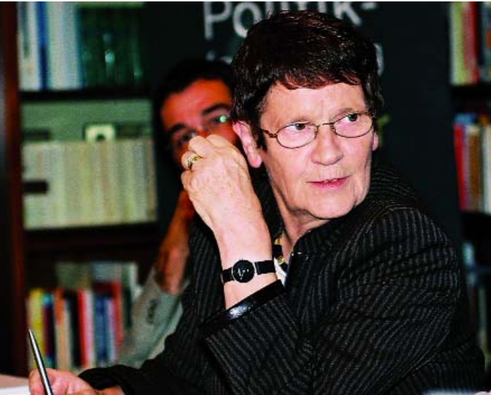
Former President of the German Bundestag, Prof. Dr. Rita Süsmuth.

The C-A-P has at its disposal the intellectual, technical and personnel resources necessary to undertake ambitious projects. Together with the long-term experience with its many partners, these resources form the Center's institutional memory.